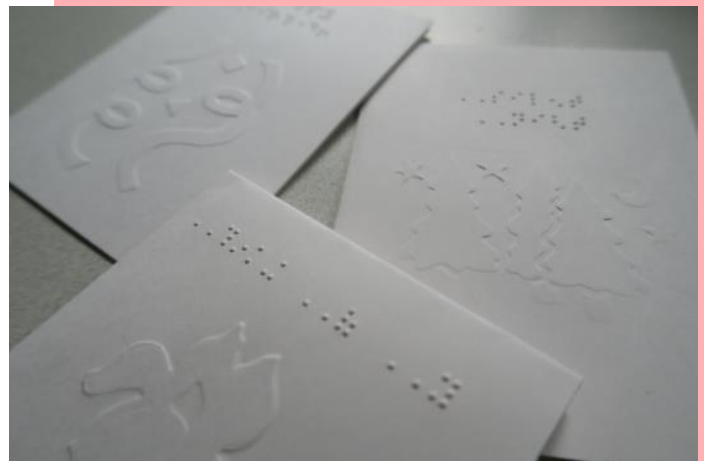
Braille greeting cards