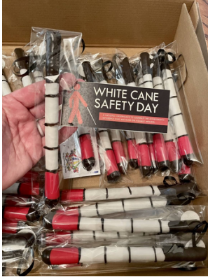
Above: White Cane Safety Day chocolate pretzels Below: Pencil Canes