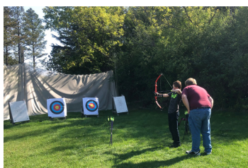
Above, a student who attended last year's Sports and Recreation Retreat takes aim in archery with the help of a sighted instructor.