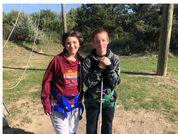
Below, two students stand in front of the high ropes course at 2021's Retreat.